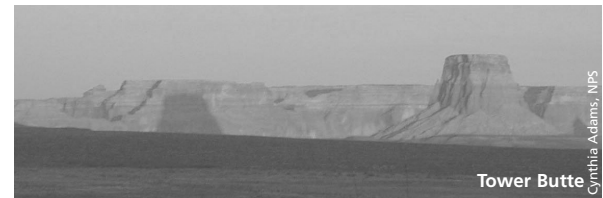
Tower Butte Cynthia Adams, NPS

In every view, there is a story. Like a window to the past, the landscape before you represents a timeline of natural and cultural events. Within the panorama that is Glen Canyon, stories and secrets are revealed; and through exploration, we discover some of its mysteries. Glance over the Glen Canyon landscape, and imagine events form a distant past.